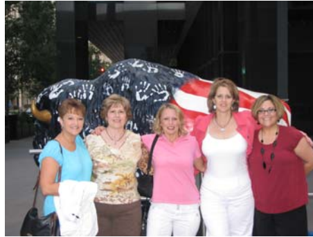
KALA girls out on the town!

members are scheduled to take the CLA examination this year and we are excited to add new CLAs to our membership.